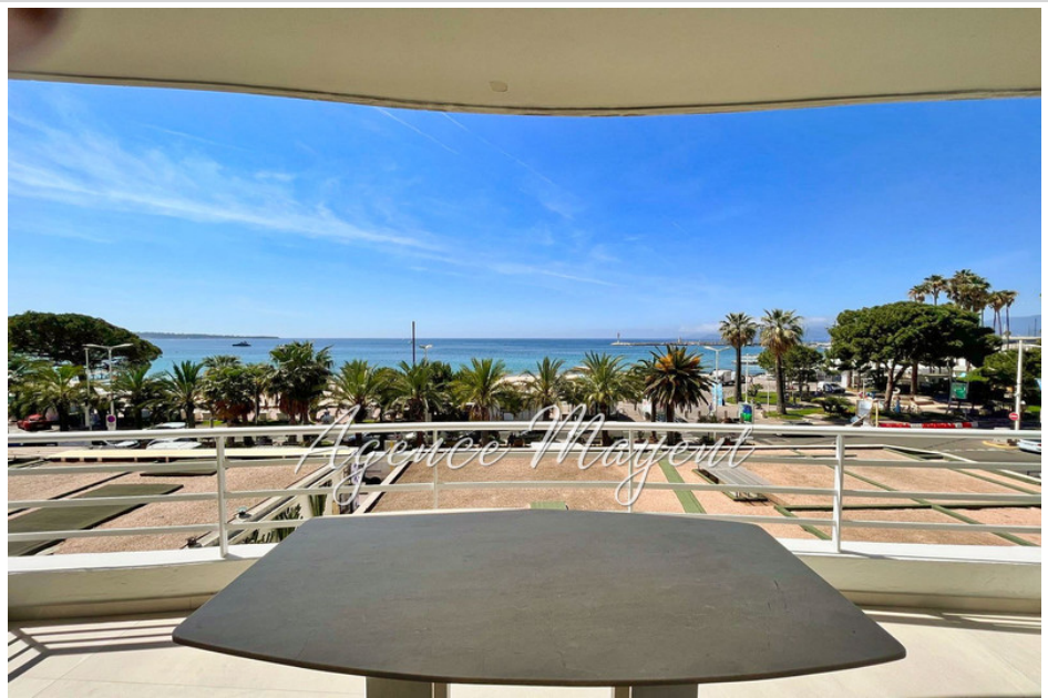
Apartment 3913 Cannes

3 rooms sea view for sale Cannes Croisette. Magnificent three-room apartment for sale ideally located in the heart of the Croisette. Located on a high floor, it consists of an entrance hall, living room, dining room with equipped American kitchen